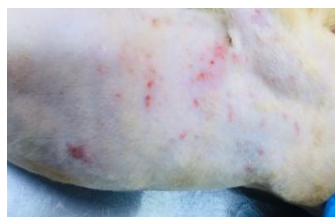
Figure 4: Complete alopecia in cat.

Alopecia: According to the reported cases; 10 affected animals from Basrah private clinic which appear a severe hair loses in some body parts developed partial or complete alopecia which occur due to systemic disease or skin sensitivity or uncleaned and dirty places in Figure (4), there cases reported 5% of studied cases.