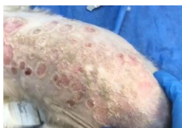
Figure 2: Feline ring worm.

Scabies Infection: Forty cases which form 20% of the total reported cases were suffering from scabies infection with exhibited redness, rash, and severe itching associated with blood from the skin and hair loss in a large way and may be crusted on the edges of the infection area especially the ear and ear edges. The laboratory examination revealed to the Notoedric cat (Feline Scabies) infection, in addition to the occurrence of large ulceration in the skin and a rise in temperature. The common site of infection in all body part, nose